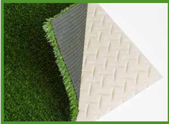
Shockpads For Standard Fields