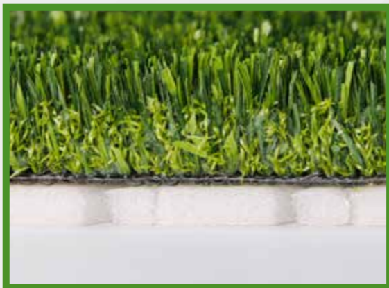
Non-Infill Grass System