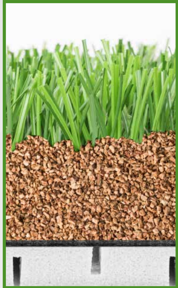
Shockpads and Cork